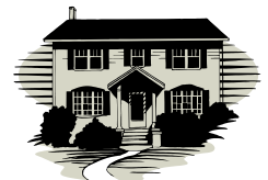
NOREIA can help you...